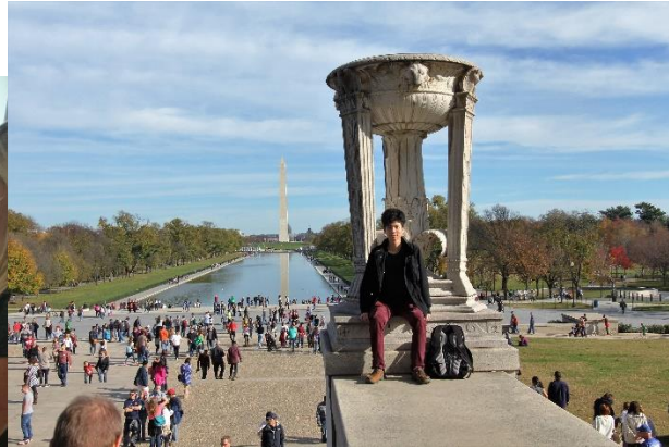
FIGURE 7- NATION MALL