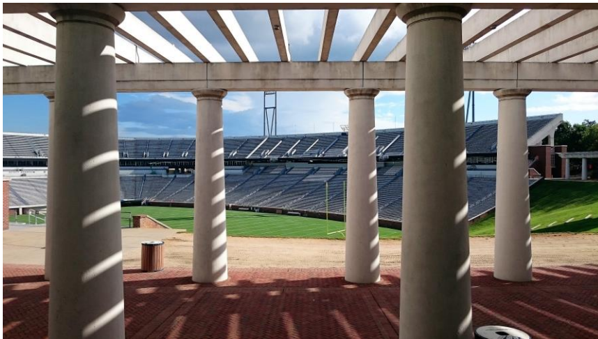
FIGURE 2- SCOTT STADIUM

I met my exchange buddies and other 4 exchange students during the McIntire orientation. We went on a few trips throughout the semester. In September, we had a Humpback Rock