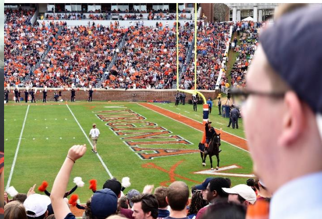
FIGURE 8- LAST HOME FOOTBALL GAME