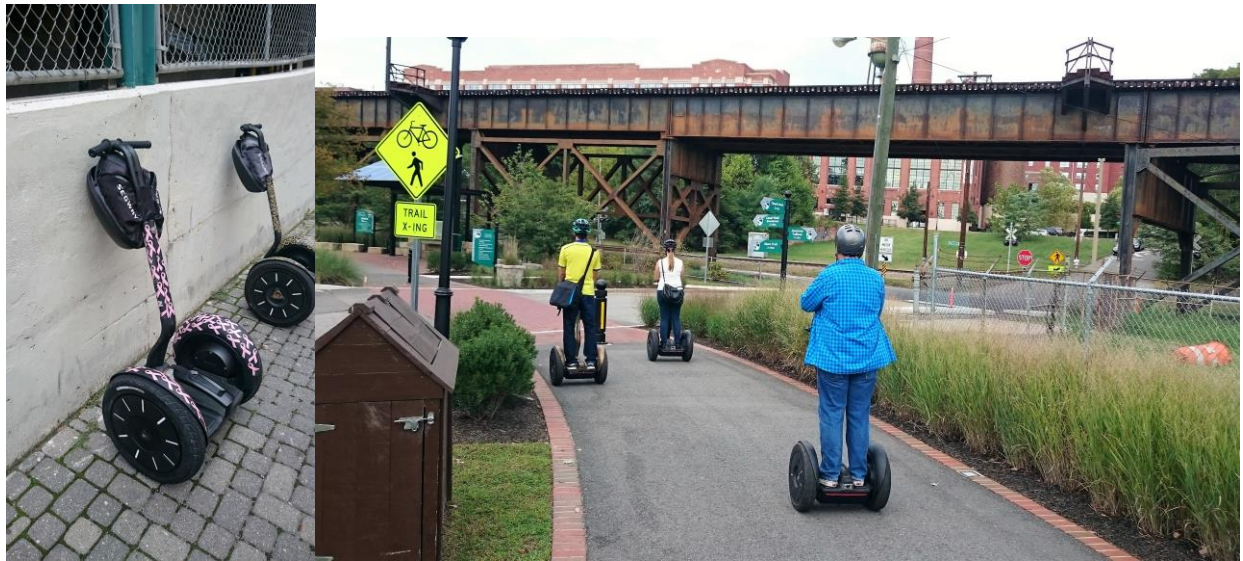
FIGURE 4- RICHMOND SEGWAY RIDE