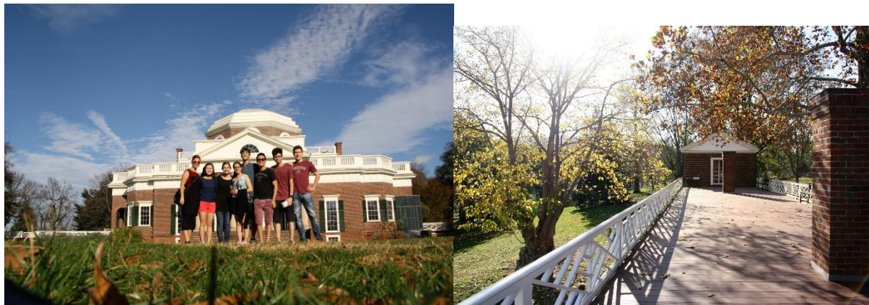
FIGURE 5- MONTICELLO

In early November, we went to Monticello. It was built by Thomas Jefferson, the third president of United States, the principal author of the Declaration of Independence and the founder of the University of Virginia. He was also an architect and designed his dream house himself, which is now Monticello.