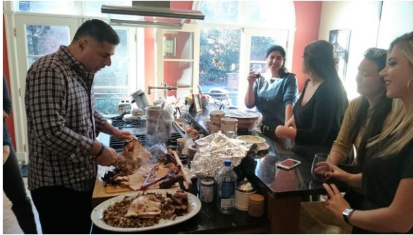
FIGURE 6- THANKSGIVING