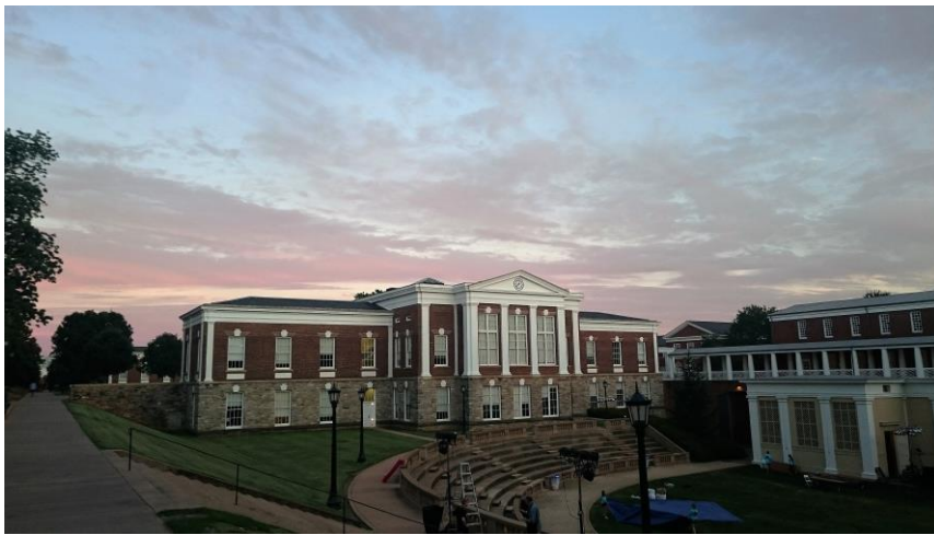
FIGURE 1- ROSS & ROBERTSON HALL (BUILDING OF MCINTIRE SCHOOL OF COMMERCE)

First, I arrived UVa by the shuttle bus “UVaExpress” organized by UVa affiliates. This is a recommended way to arrive at the “ground”. “Ground” is the UVa’s version of “campus”, and it is just one of the many unique words of choice students in UVa use that differentiates the school from the others. One advantage of taking this shuttle bus which only operated 2 days a year was that I did not have to worry a thing about settling down. The volunteers on the bus had already arranged everything for us, including a welcome dinner and assistance to get access to our dorms. It was a warm welcome and a great day to make friends with first year and other exchange students who were also new to the ground.